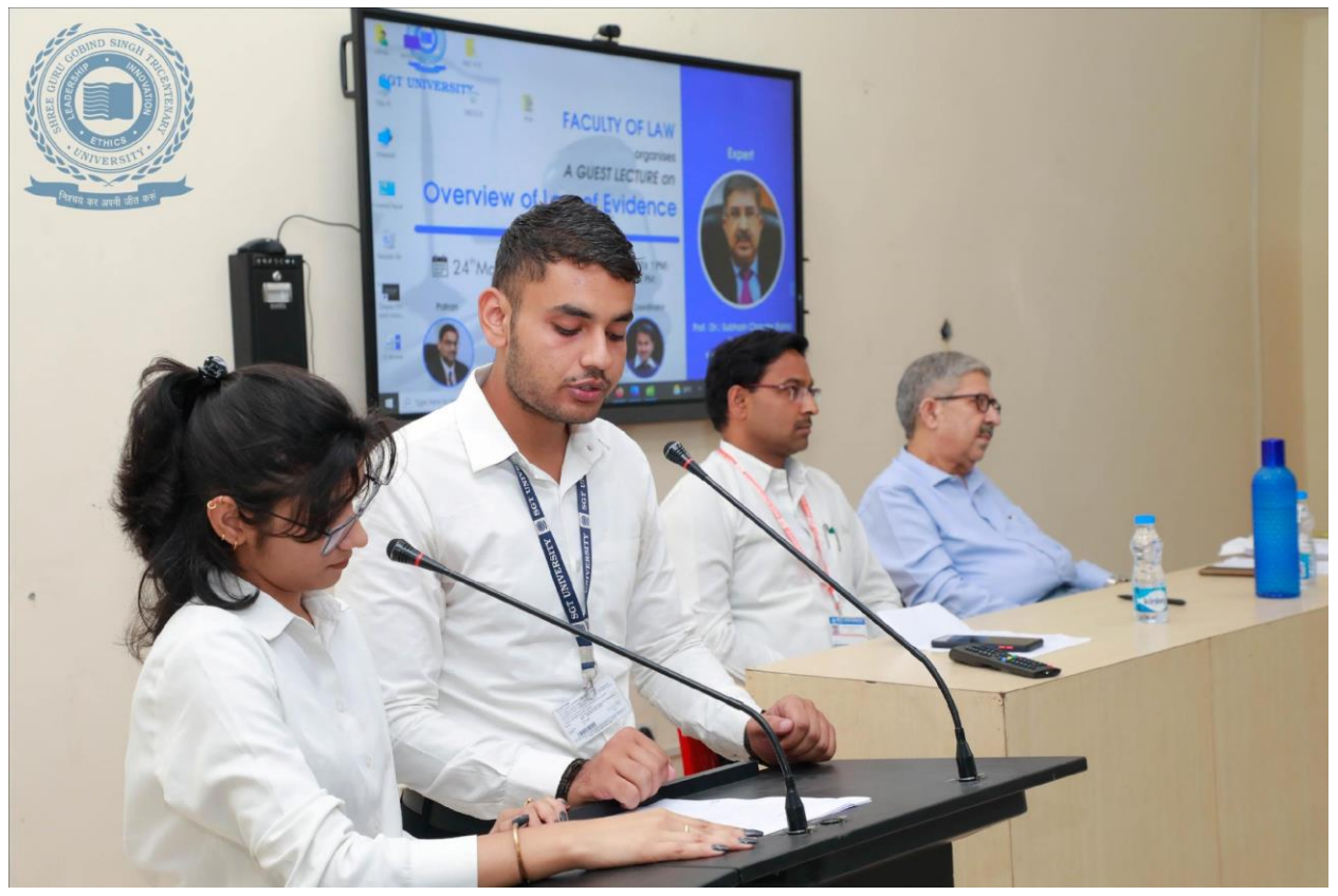
Figure: 04 Students anchor the event

Budhera, Gurugram-Badli Road, Gurugram (Haryana) – 122505 Ph.: 0124-2278183, 2278184, 2278185