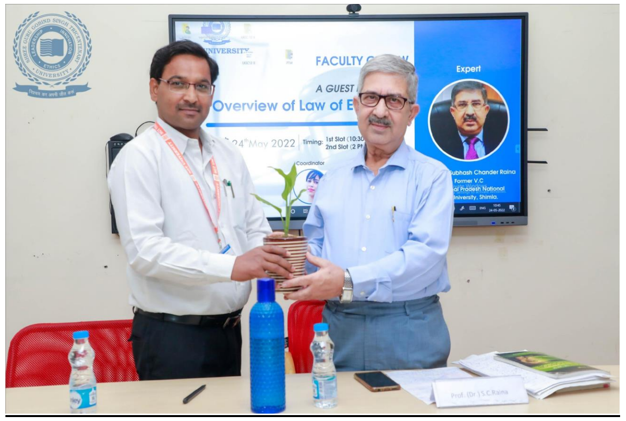
Figure: 03 The Dean of the Faculty of Law felicitates the guest speaker.

Budhera, Gurugram-Badli Road, Gurugram (Haryana) – 122505 Ph.: 0124-2278183, 2278184, 2278185