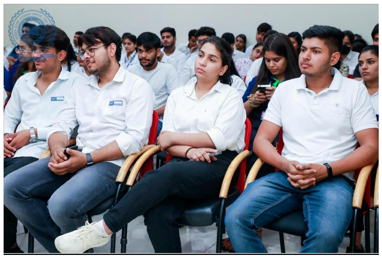
Figure: 05 A section of audience

Budhera, Gurugram-Badli Road, Gurugram (Haryana) – 122505 Ph. : 0124-2278183, 2278184, 2278185