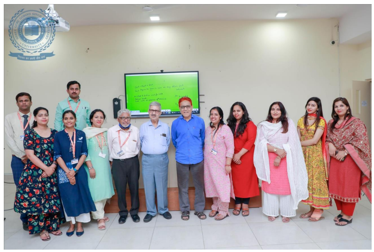
Figure: 02 Faculty members with the guest speaker