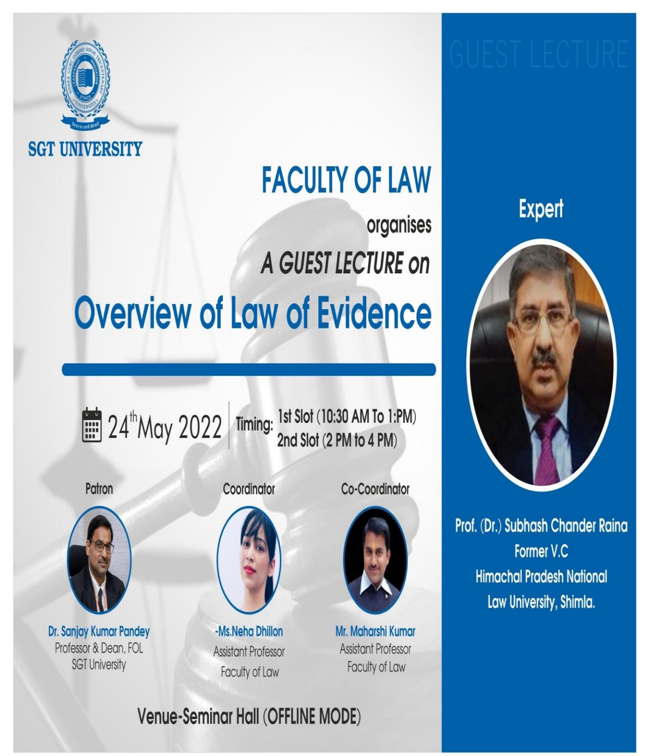
Figure :01 E-banner of the event

SHREE GURU GOBIND SINGH TRICENTENARY UNIVERSITY (UGC Approved) Gurugram, Delhi-NCR